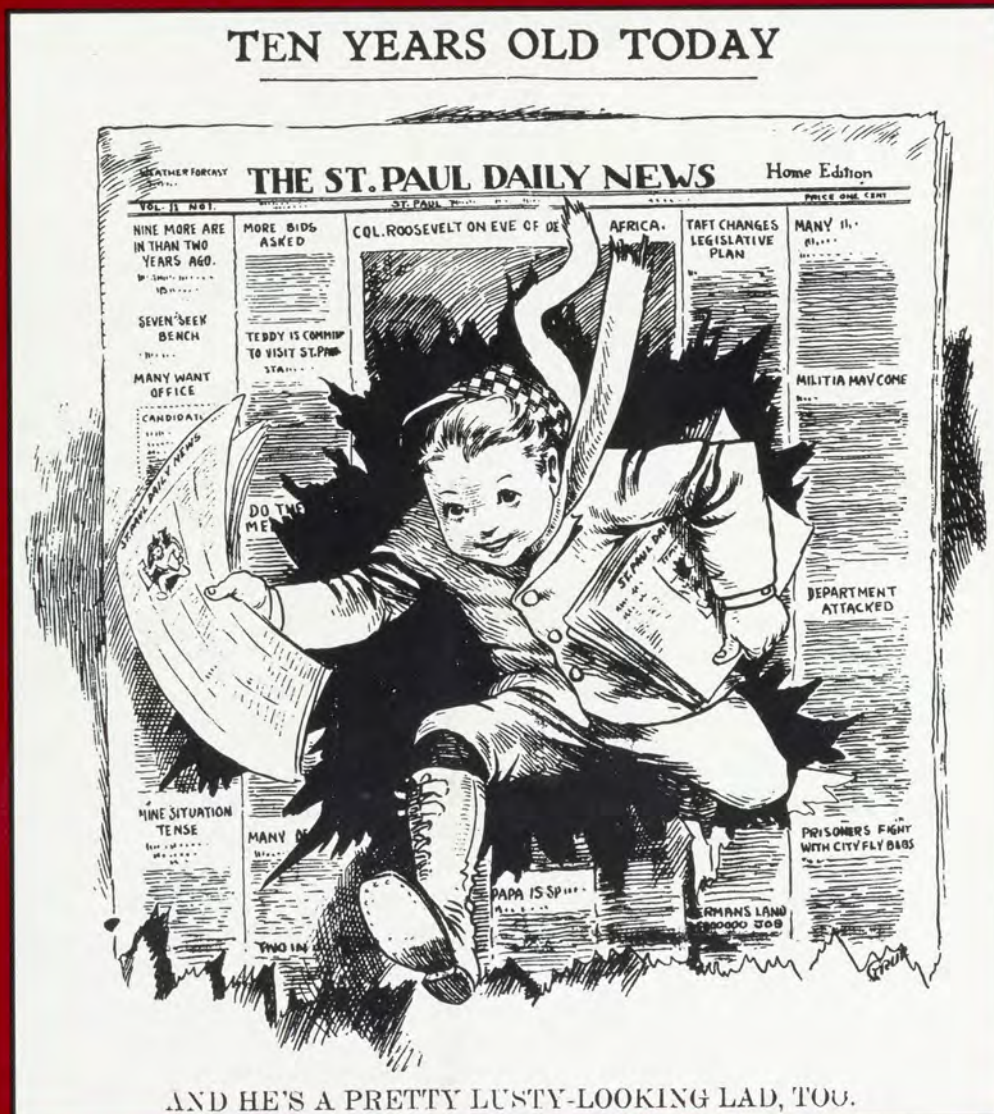
A cartoon in the St. Paul Daily News celebrating the tenth anniversary of the beginning of publication on March 1, 1900. See the history of the Daily News beginning on page 4.