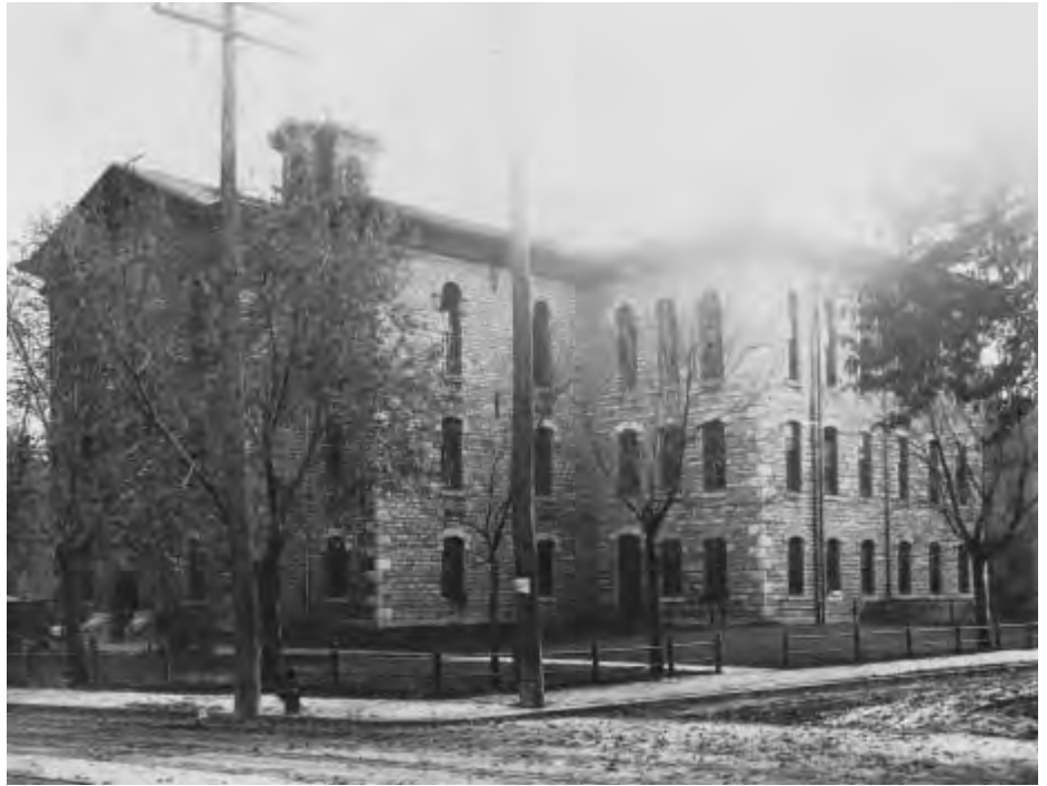
Franklin School at Tenth and Broadway where Sitting Bull witnessed a fire drill.