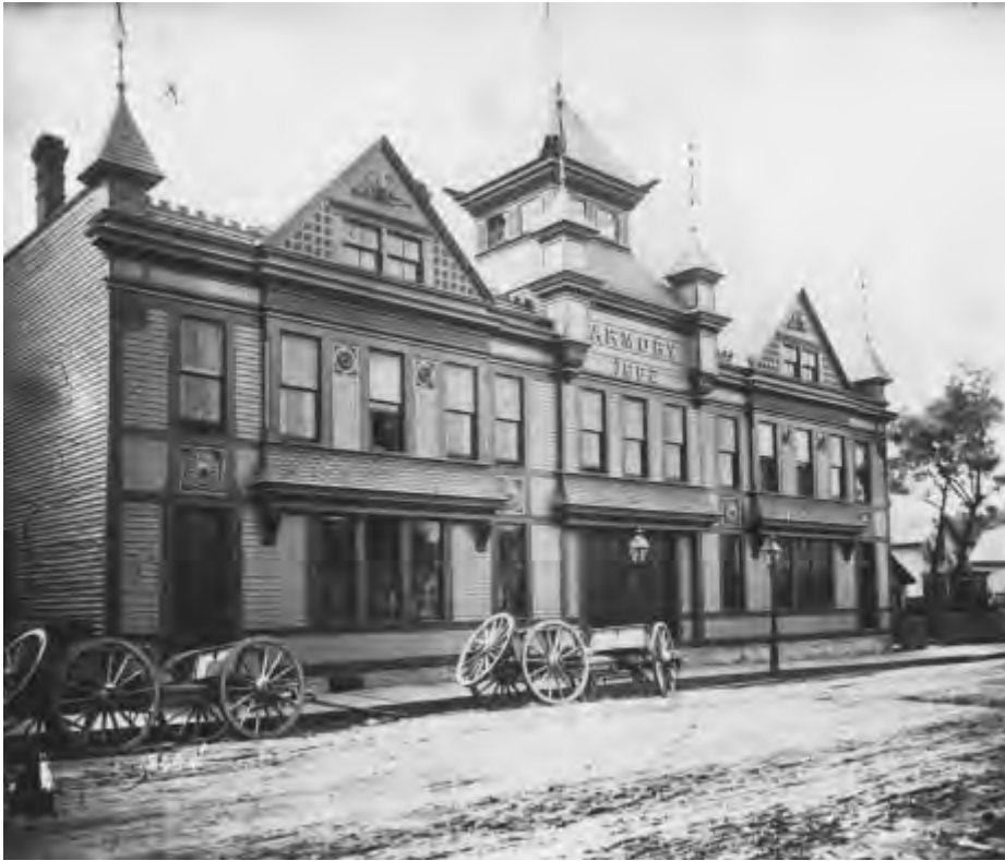
A stop on Sitting Bull's tour: the St. Paul Armory at West Sixth Street and Main in 1895.