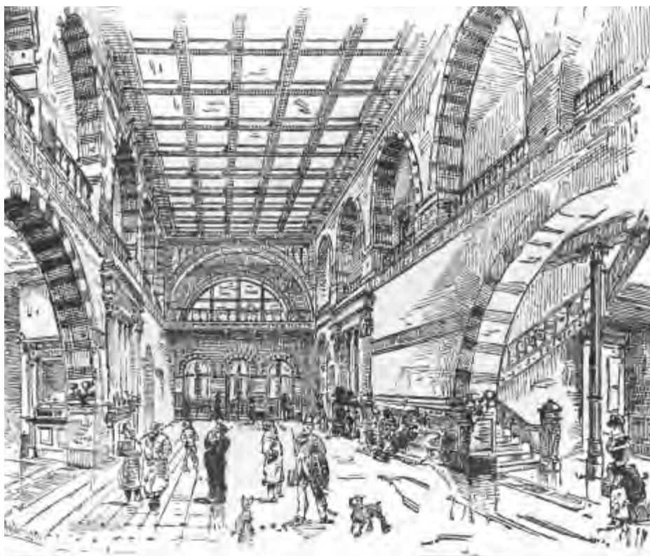
The interior of St. Paul’s Union Depot as it looked upon Sitting Bull’s arrival there in 1884. Accounts of his visit provide the reader with a fascinating historical tour of St. Paul as it was during the 1880s.

Not all press coverage displayed equal thoughtfulness and respect. With Minnesota’s Dakota Conflict (1862), the carnage at Little Bighorn (1876), and the years of war that followed still in living memory, the St. Paul Dispatch reflected much popular sentiment when it charged that Sitting Bull, “for his past infamies [was] worthy of the title of ‘The Great Unhung.’” Other papers called him “butcherer of Custer,” “ferocious sav-