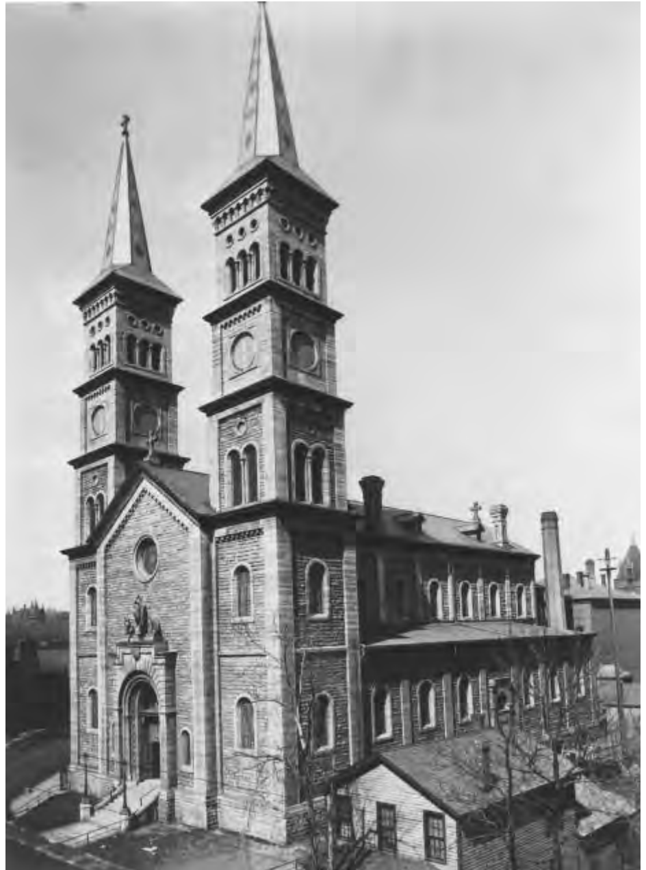
Assumption Church as it looked when Sitting Bull attended 10:30 a.m. mass there. This is the only building visited by Sitting Bull that still stands today.

At nine the party began its tour of the St. Paul public schools. The two carriages also bore the school board president and school director, prompting one newspaper wag to