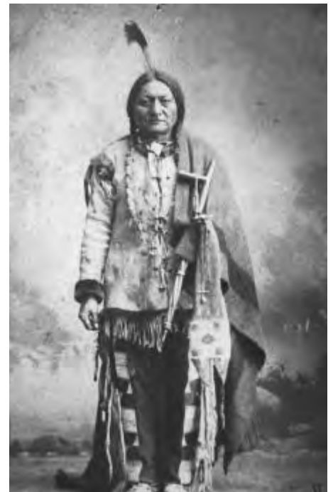
A carte-de-visite photograph of the Lakota leader that, at $1.50 each, found a ready market in St. Paul.