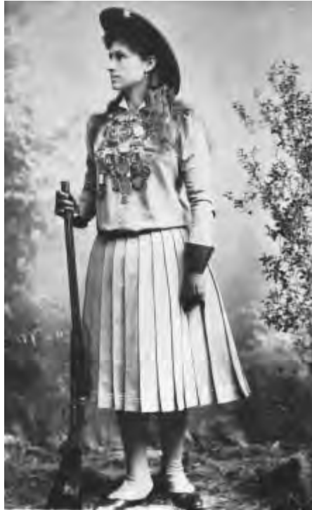
"Little Sure Shot," Annie Oakley.