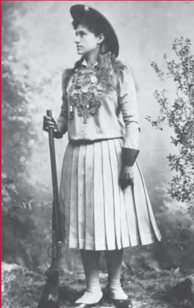
"Little Sure Shot," Annie Oakley. Photograph from the Annie Oakley Foundation Collection, Greenville, Ohio. See article beginning on page 4.