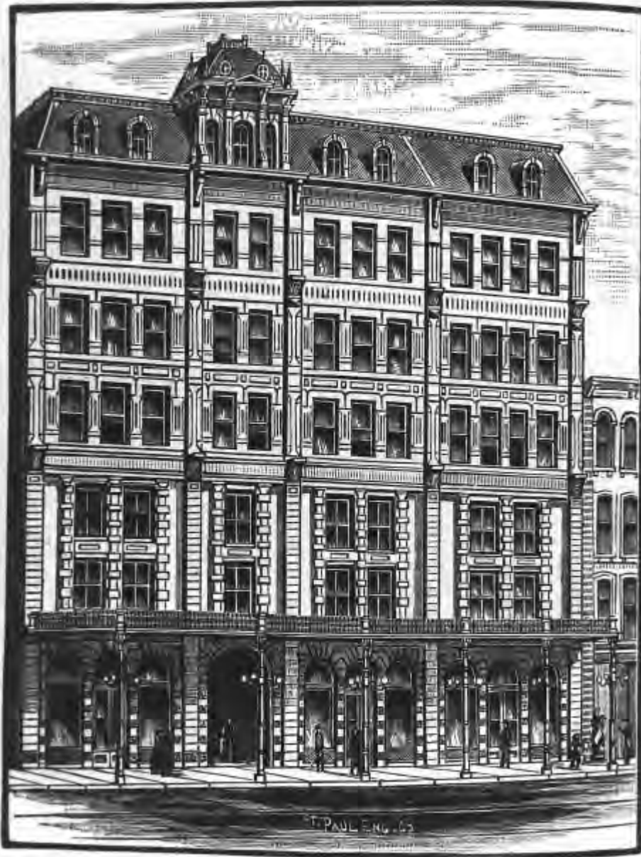
The Grand Opera House, the scene of the supposed attempt on Sitting Bull's life.

The government, fearing a Lakota uprising, already had planned for Sitting Bull to be taken out of the picture. McLaughlin sent Indian police to capture him at his home on the early morning of December 15, 1890. The consequences of such an action were predictable. During the arrest, Sitting Bull's followers fired on the police; the police in response killed Sitting Bull and a son, Crowfoot. After the great man's death, McLaughlin wrote smugly, "... [T]he shot that killed