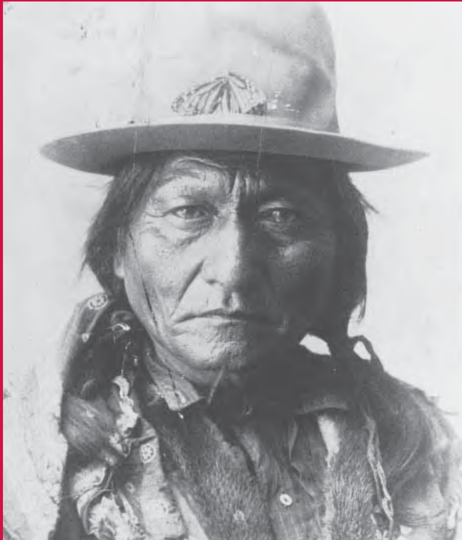
Sitting Bull around 1880, just before his 1884 visit to St. Paul. Minnesota Historical Society photograph. See article beginning on page 4 on Sitting Bull's visit and an alleged attempt on his life. Minnesota Historical Society photograph.