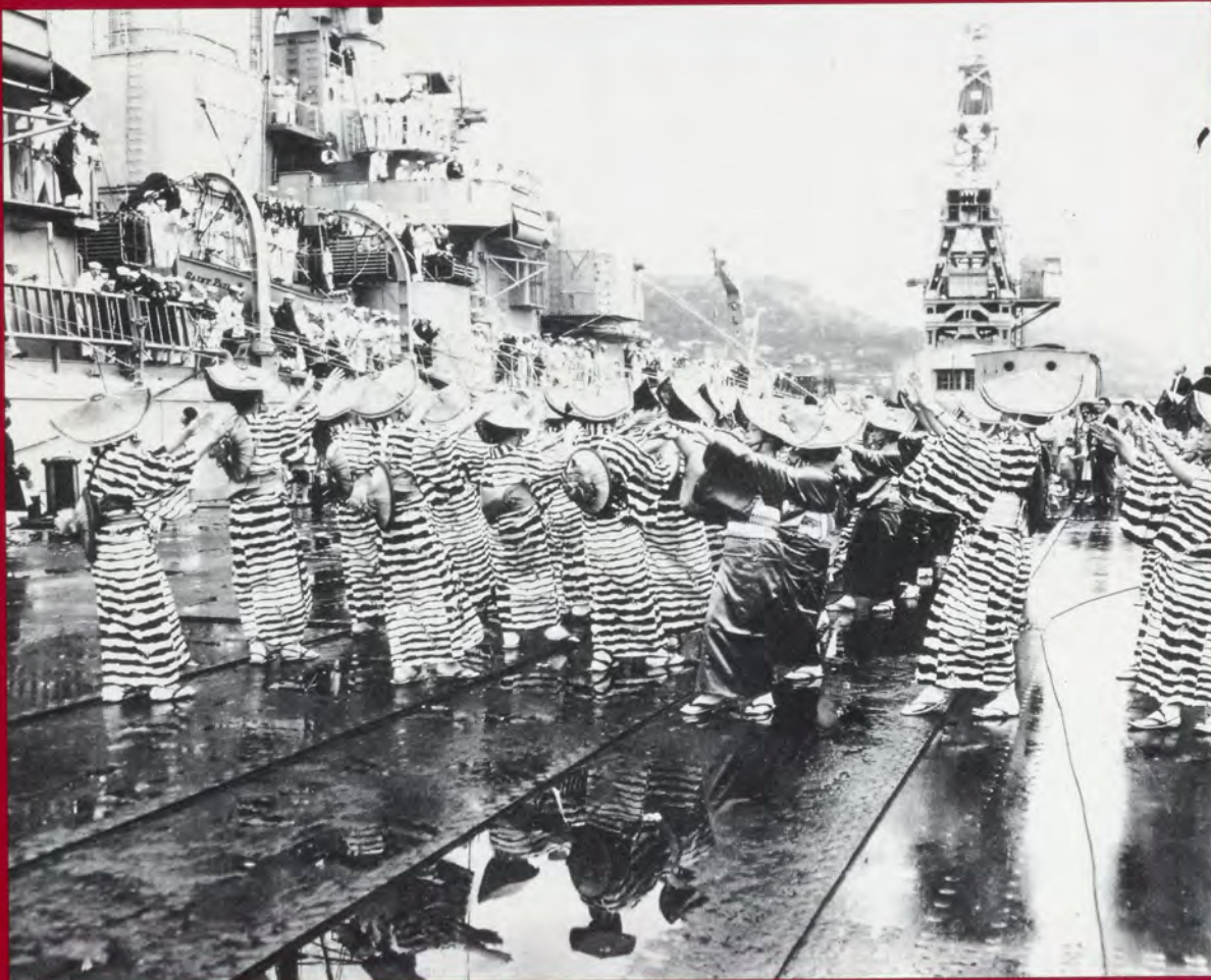
Women from the Yokosuka, Japan, Folk Dance Association perform Japanese folk dances for U. S. S. St. Paul crewmembers as the heavy cruiser prepares to leave Yokosuka for the United States on July 6, 1962. See article beginning on page 4.

D-Day Remembered By Seven Who Were There