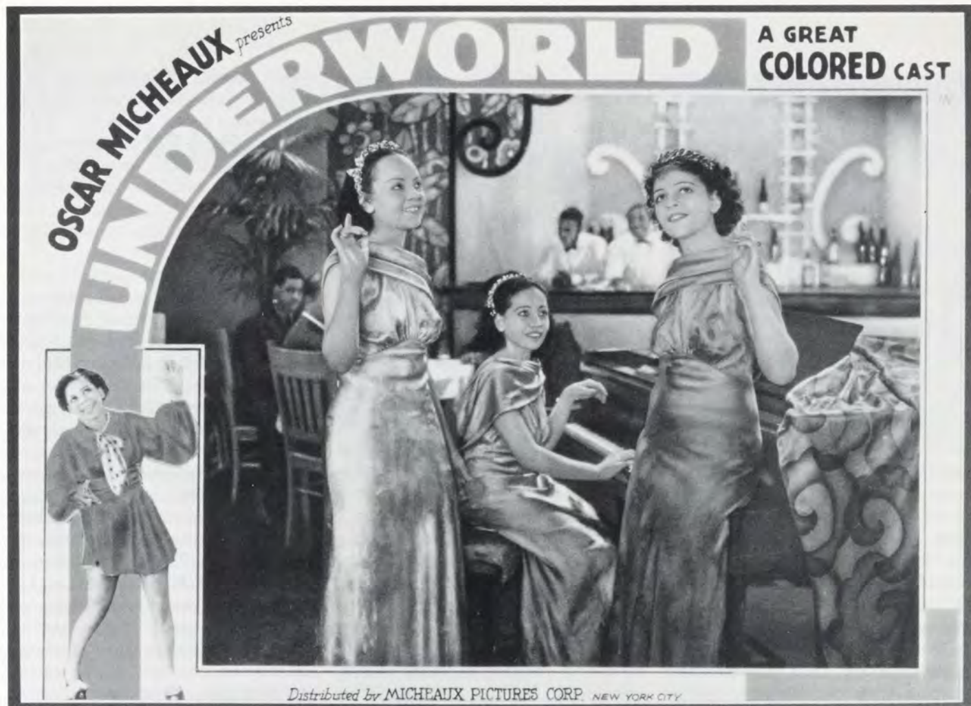
Lobby card from "Oscar Micheaux presents Underworld ," 1936. This and other items shown here are from the exhibit, "A Stronger Soul Within a Finer Frame," which the Ramsey County Historical Society is opening April 17 at Landmark Center, St. Paul. The photographs are from the Touring Exhibition Program of the Weisman Art Museum at the University of Minnesota.