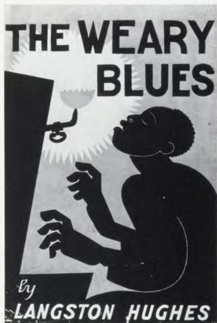
Jacket design by Miguel Covarrubias for Langston Hughes's The Weary Blues , published in 1929 by Knopf, New York, and republished in 1944.