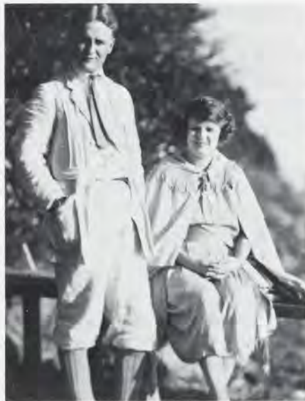
F. Scott and Zelda Fitzgerald in Dellwood in 1921.

The zoo was created in 1900 and lasted for more than thirty years. In the beginning, it was quite a novelty. The animals were housed in cages at first, then, after 1919, in a concrete building. They were well cared-for but, after repeated flooding of the island, they were moved to Como Zoo in the early 1930s.