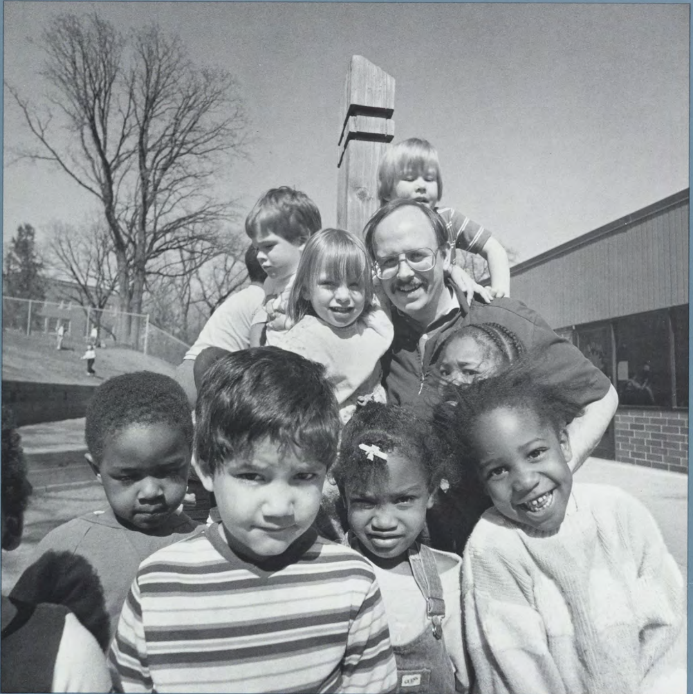
A group of smiling youngsters at the Thomas-Dale Child Care Center, part of the Amherst H. Wilder Foundation's Child Care Services Program. Child care issues are one of the many concerns of the Saint Paul Foundation. See article beginning on page 4.