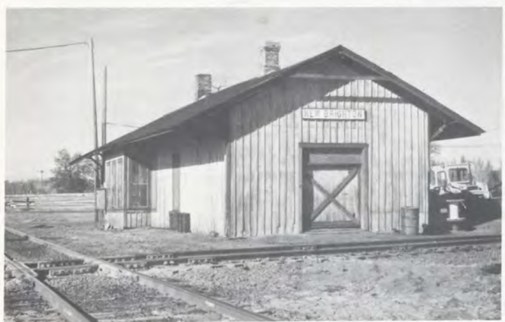
Bulwer Junction depot, New Brighton. See pages 3-12.