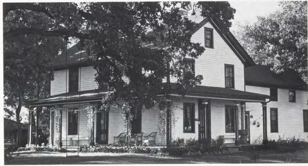
The Gibbs Farm Museum, owned by the Ramsey County Historical Society, at Cleveland and Larpenteur in Falcon Heights.

NON-PROFIT ORGANIZATION U.S. Postage PAID St. Paul, MN Permit #3989