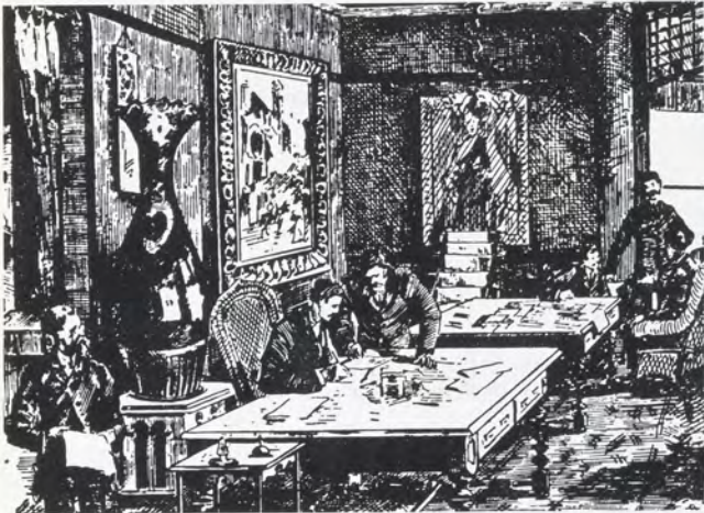
The old Club's "lounging room." page 9

The Gibbs Farm Museum, owned by the Ramsey County Historical Society, at Cleveland and Larpenteur in Falcon Heights.